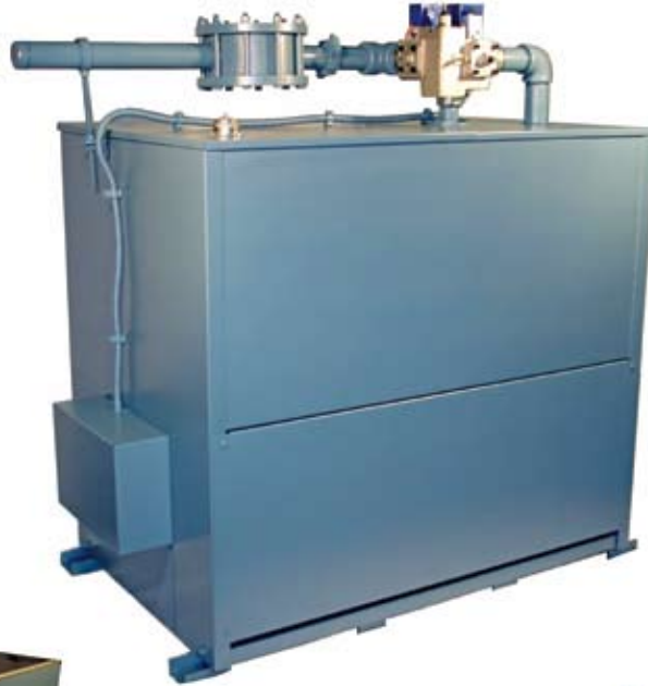
Complete Power Unit