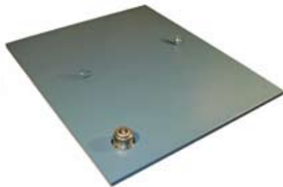
Lid Left Side